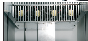
Fans provide 'Laminar Airflow'

All models can be upgraded to EX specification to include fully automatic control of humidity with the addition of the EX water pump system.