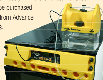
Humidity Pump Module connected

All the standard OvaEasy Advance series II models provide a continuous readout of incubation humidity and require the user to alter humidity to achieve the ideal average level. The EX version with the Humidity Pump effectively maintains the humidity level precisely at the level the user sets irrespective of changes in room humidity and so overcomes problems that can commonly lead to eggs failing to hatch – especially in the latest stages of incubation. The Humidity Pump includes an external water reservoir eliminating the chances of water in the incubator harbouring bacteria. The Humidity Pump module is designed to work seamlessly with the OvaEasy Advance incubators and can be purchased later as an upgrade from Advance to Advance EX status.